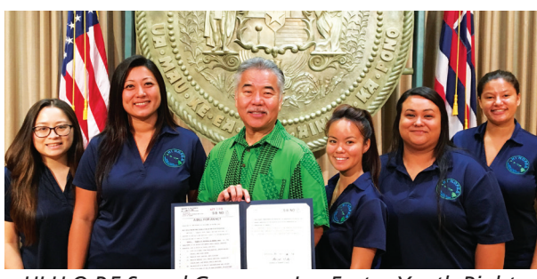
HI H.O.P.E.S. and Governor Ige Foster Youth Rights Bill Signing Act 105, July 5, 2018